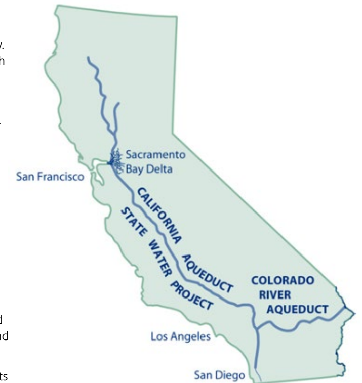
Statewide imported water infrastructure